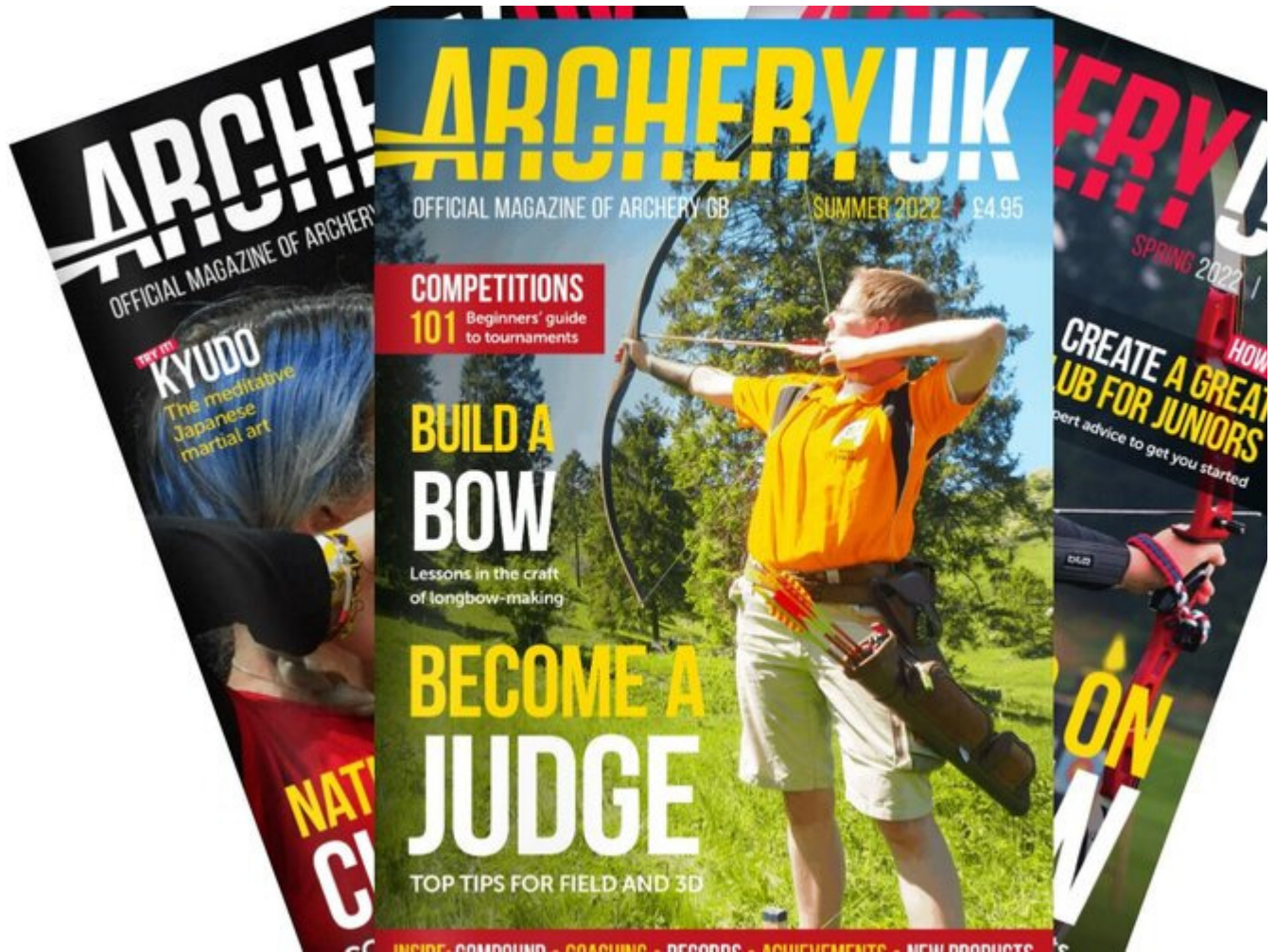
○ Archery UK Magazine