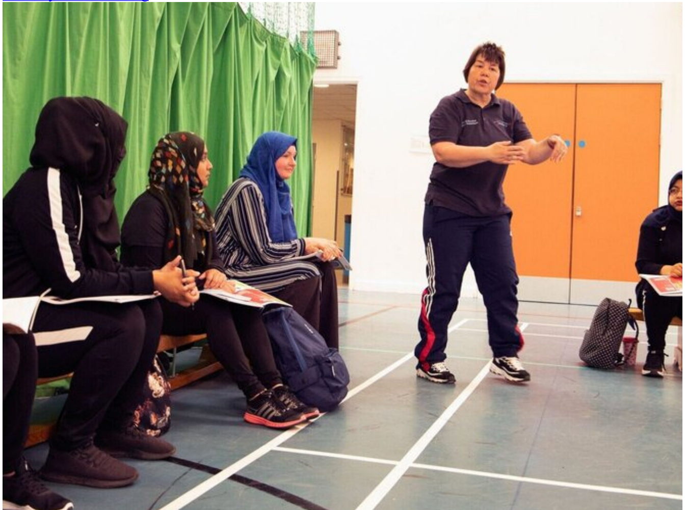
Archery GB Coaching