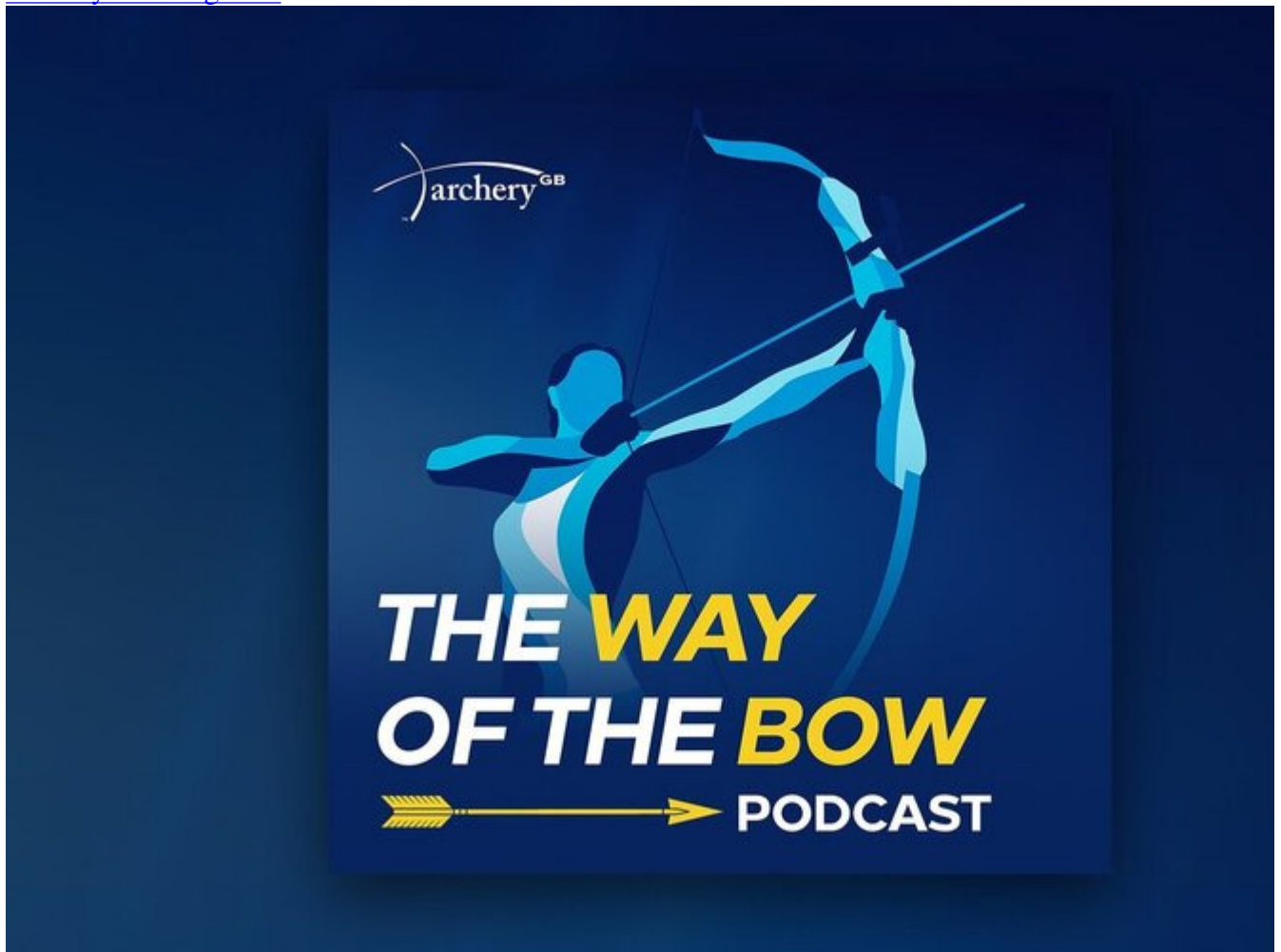
○ The Way of The Bow Podcast