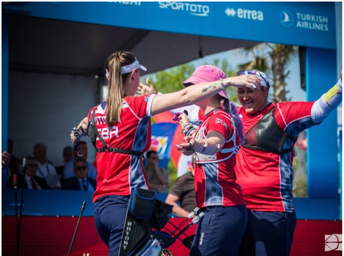
○ Archery GB National Squad